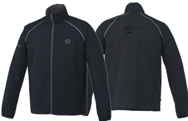
EGMONT INSPIRE LOOK 3 EMBROIDERY @ LEFT CHEST EMBROIDERY @ RIGHT SLEEVE DEBOSS @ BACK ACROSS SHOULDERS