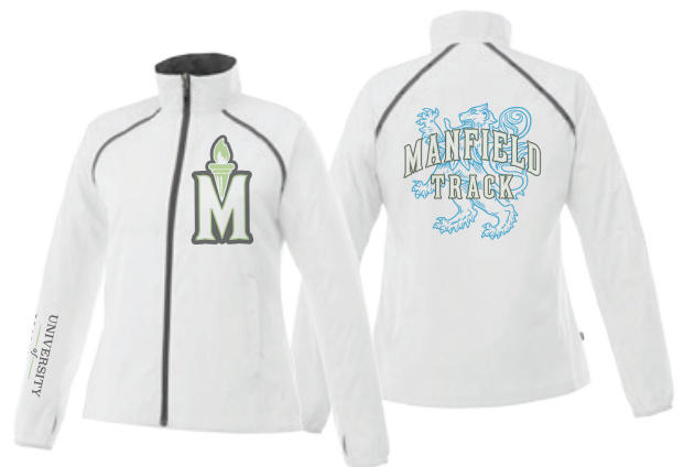
EGMONT INSPIRE LOOK 4: IMAGINEER SPECIAL* INFUSION @ LEFT CHEST INFUSION DOWN RIGHT FOREARM INFUSION @ FULL BACK

T Transfer E Embroidery D Deboss I inFusion (only on white)