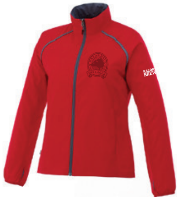
EGMONT INSPIRE LOOK 1 TONAL TRUE EDGE @ LEFT CHEST EMBROIDERY @ LEFT SLEEVE