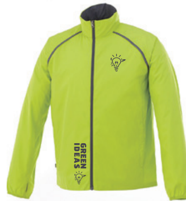
EGMONT INSPIRE LOOK 2 TRUE EDGE @ LEFT CHEST TRUE EDGE @ RIGHT ZIPPER