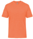
HEATHER ORANGE* 1635C

*65/35 polyester/cotton **60/40 cotton/polyester ***90/10 cotton/viscose ****98/2 cotton/viscose