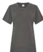
EARTH PEWTER Black 7C