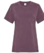
EARTH EGGPLANT 262C

464 HARGRAVE STREET · WINNIPEG, MANITOBA · R3A 0X5 · CANADA