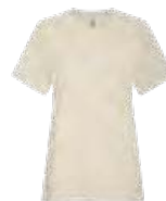
EARTH BONE 7534C