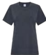
EARTH NAVY 2379C