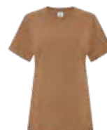
EARTH CARAMEL 7568C