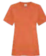
EARTH ORANGE 7579C