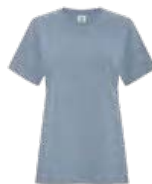
EARTH STONE BLUE 2157C