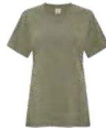
EARTH MILITARY 7770C