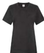
EARTH BLACK Black 6C

Textile fabric colours are subject to dye lot variation and will not be exact match to print Pantone reference