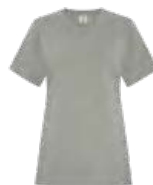
EARTH DOVE 416C