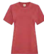
EARTH RED 202C