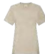
EARTH SAND 7527C