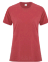
HEATHER RED** 193C