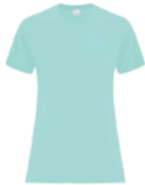
TRUE CELADON 7464C