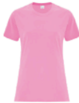
CANDY PINK 189C