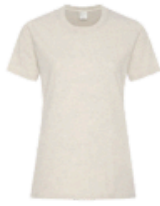
OATMEAL HEATHER*** Warm Grey 2C

*90/10 cotton/polyester **50/50 cotton/polyester ***98/2 cotton/polyester