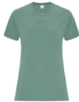
LAUREL GREEN 4198C