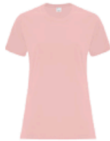
PALE BLUSH 5025C