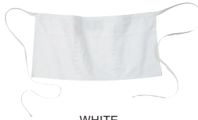
WHITE No PMS