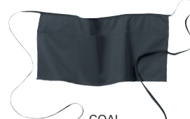
COAL GREY 432C