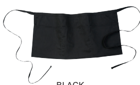
BLACK Black 6C

Textile fabric colours are subject to dye lot variation and will not be exact match to print Pantone reference.