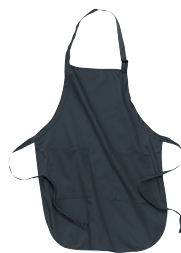
COAL GREY 432C