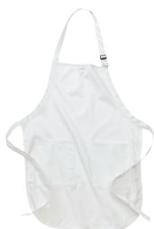
WHITE No PMS