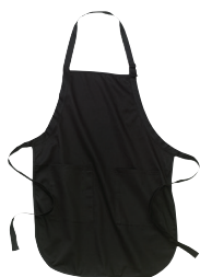
BLACK Black 6C

Textile fabric colours are subject to dye lot variation and will not be exact match to print Pantone reference.