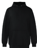
BLACK Black 6C

Textile fabric colours are subject to dye lot variation and will not be exact match to print pantone reference