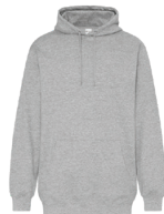
ATHLETIC HEATHER Cool Grey 5C