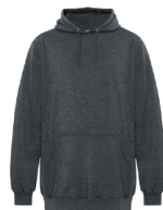
DARK HEATHER GREY 7540C