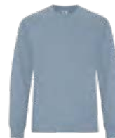
EARTH STONE BLUE 2157C