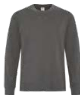
EARTH PEWTER Black 7C