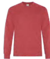
EARTH RED 202C