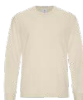
EARTH BONE 7534C