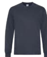
EARTH NAVY 2379C