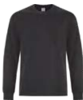
EARTH BLACK Black 6C

Textile fabric colours are subject to dye lot variation and will not be exact match to print Pantone reference