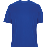
TRUE ROYAL 4154C