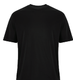
BLACK Black 6C

Textile fabric colours are subject to dye lot variation and will not be exact match to print pantone reference