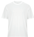
WHITE No PMS