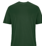
FOREST GREEN 7736C

Due to the nature of polyester, special care must be taken throughout the decoration process.