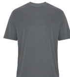
COAL GREY Cool Grey 10C