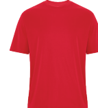
TRUE RED 200C