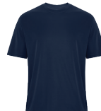
TRUE NAVY 539C