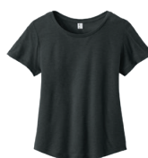
SPACE BLACK Black 3C