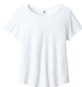
BRIGHT WHITE No PMS