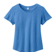
AZURE BLUE 279C