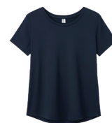
NIGHT SKY NAVY 533C