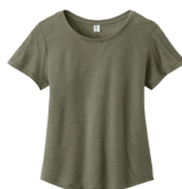
OLIVE YOU GREEN 5773C