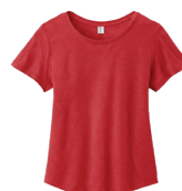
RISE UP RED 186C