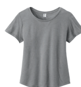
ALUMINUM GREY 423C