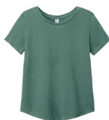
DEEP SEA GREEN 2217C