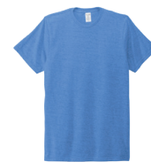
AZURE BLUE 279C