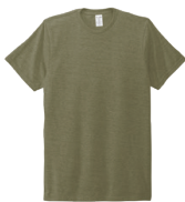
OLIVE YOU GREEN 5773C