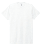
BRIGHT WHITE No PMS