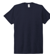
NIGHT SKY NAVY 533C