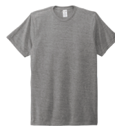
ALUMINUM GREY 423C