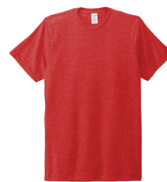
RISE UP RED 186C

464 HARGRAVE STREET · WINNIPEG, MANITOBA · R3A 0X5 · CANADA