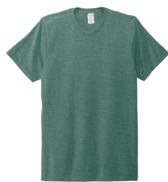
DEEP SEA GREEN 2217C