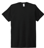
DEEP BLACK Black C

Textile fabric colours are subject to dye lot variation and will not be exact match to print Pantone reference.