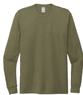
OLIVE YOU GREEN 5773C