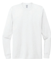
BRIGHT WHITE No PMS