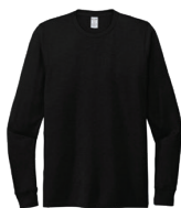
DEEP BLACK Black C

Textile fabric colours are subject to dye lot variation and will not be exact match to print Pantone reference.