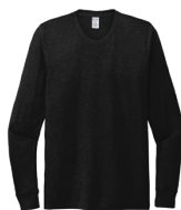
SPACE BLACK Black 3C