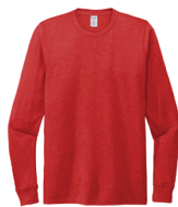
RISE UP RED 186C