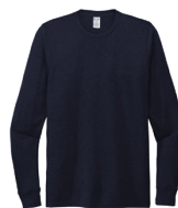
NIGHT SKY NAVY 533C