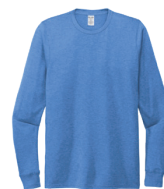
AZURE BLUE 279C