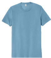
ARCTIC BLUE 646C