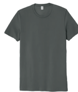
TERRAIN GREY 7540C