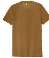
CANYON DRIFT 7568C