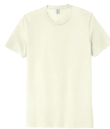
WHITE SAND No PMS