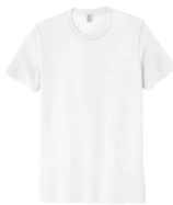
BRIGHT WHITE No PMS