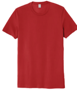
REVOLUTION RED 187C