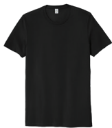
DEEP BLACK Black C

Textile fabric colours are subject to dye lot variation and will not be exact match to print Pantone reference.