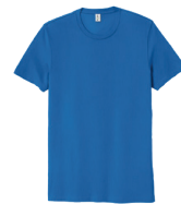
BEACON BLUE 2151C