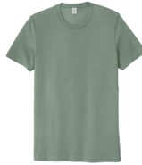
MATCHA GREEN 4198C