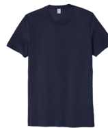
NIGHT SKY NAVY 533C