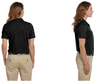
Featured Color: BLACK