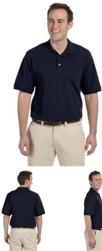
Featured Color: NAVY