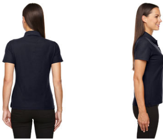
Featured Color: NAVY