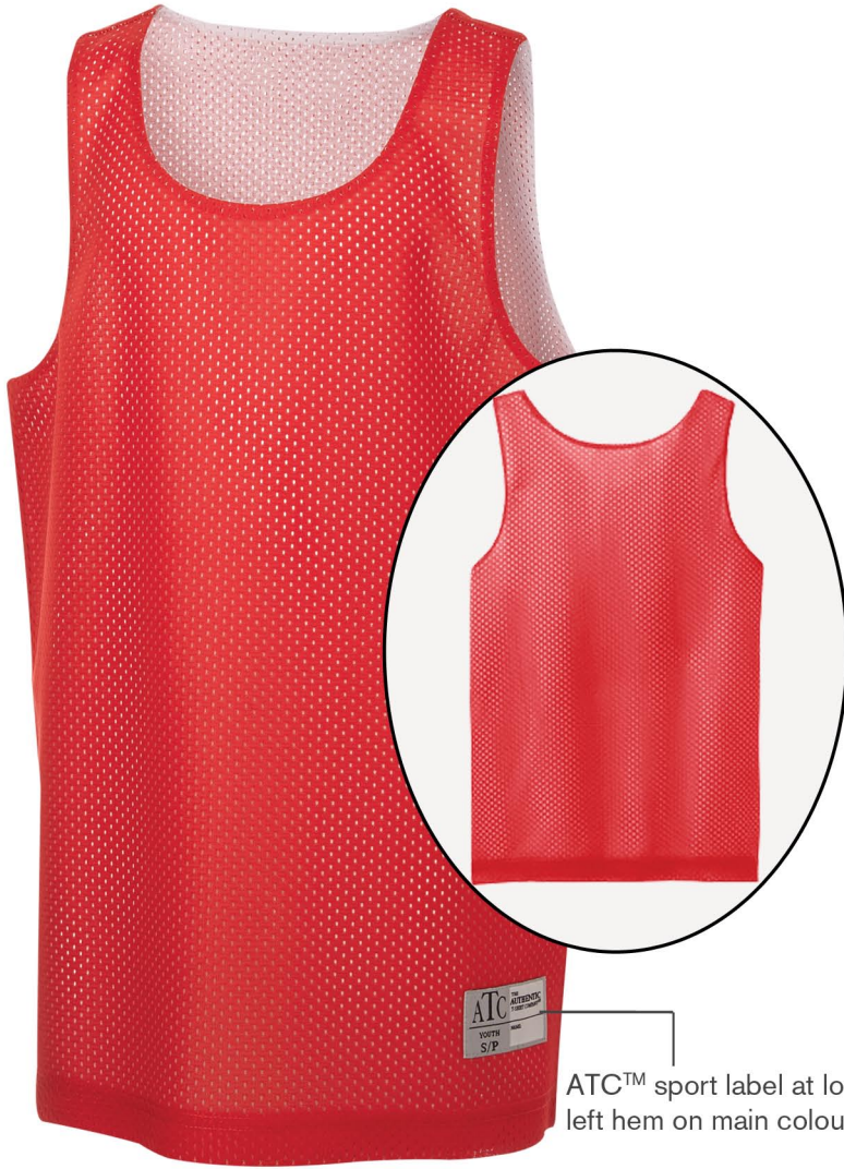
ATC™ sport label at lower left hem on main colour side